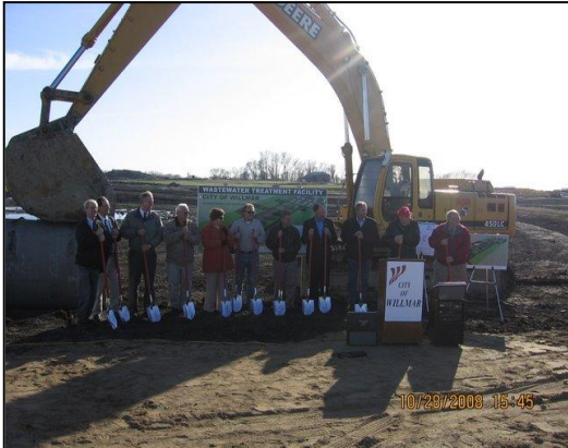
Area legislators and City Council members throw out the first shovel of dirt at the Groundbreaking Ceremony.