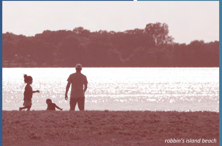
robbin's island beach