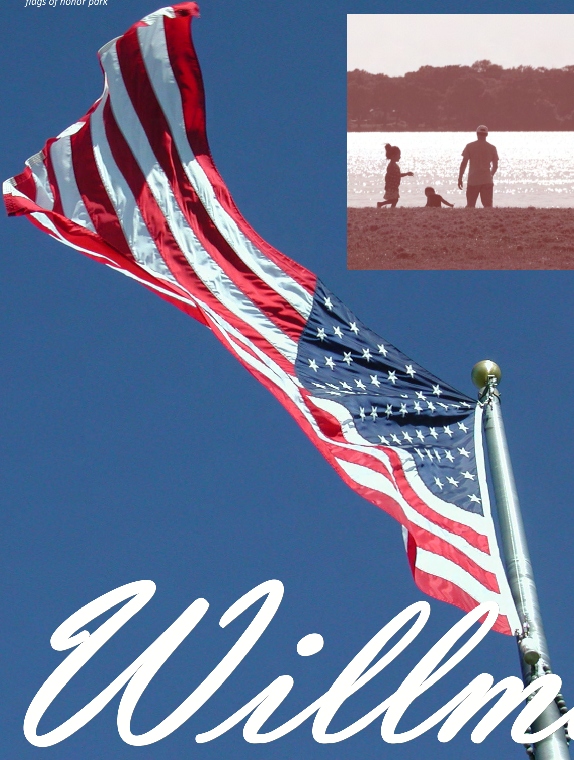
flags of honor park